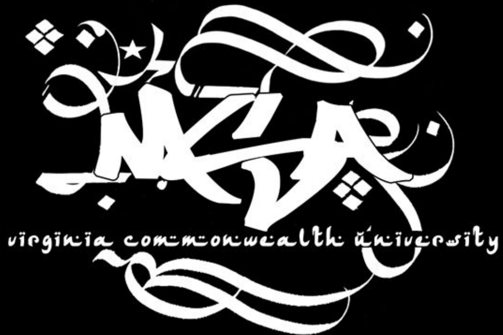
VCU Muslim Students Association T-Shirt Design 2012