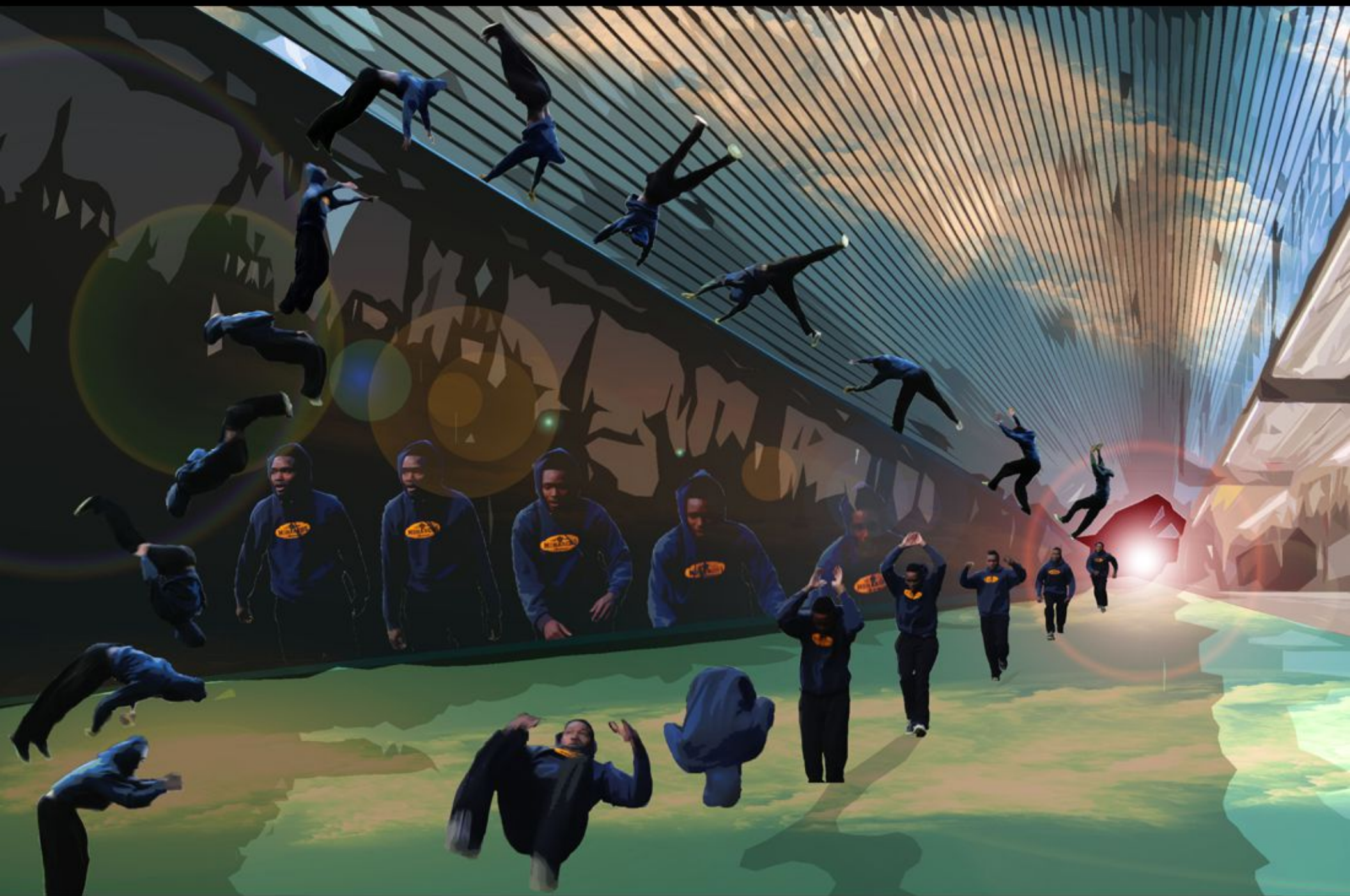
The Train / 2013